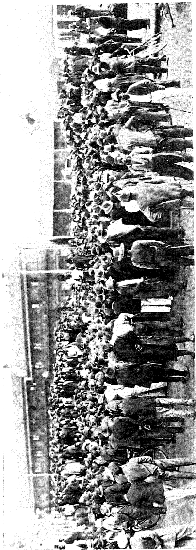
A SUNDAY MEETING OF NATIVE WORKERS IN JOHANNESBURG.